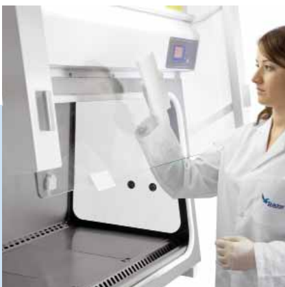
Easy cleaning of the inside window.

The Bio II Advance has a colour screen which enables easy and quick viewing of the safety parameters. The visual display shows the level of filter clogging, which is extremely useful for optimising the service. The display also shows laminar speed flow to control the cabinet's status at all times.